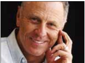
Morris Dees, Civil Rights Activist, Attorney, Author "With Justice for All" December 9, 2009