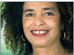
Angela Davis, Human Rights Activist, Author "Frameworks for Social Justice" February 10, 2010

Civil rights and diversity speaker Morris Dees is the co-founder of the Southern Poverty Law Center, a non-profit group specializing in lawsuits involving civil rights violations, domestic terrorism, and hate-motivated crimes. He focuses his attention on anti-government militias. In his brilliant expose Gathering Storm: America's Militia Threat , Dees explains the dangers these groups represent.